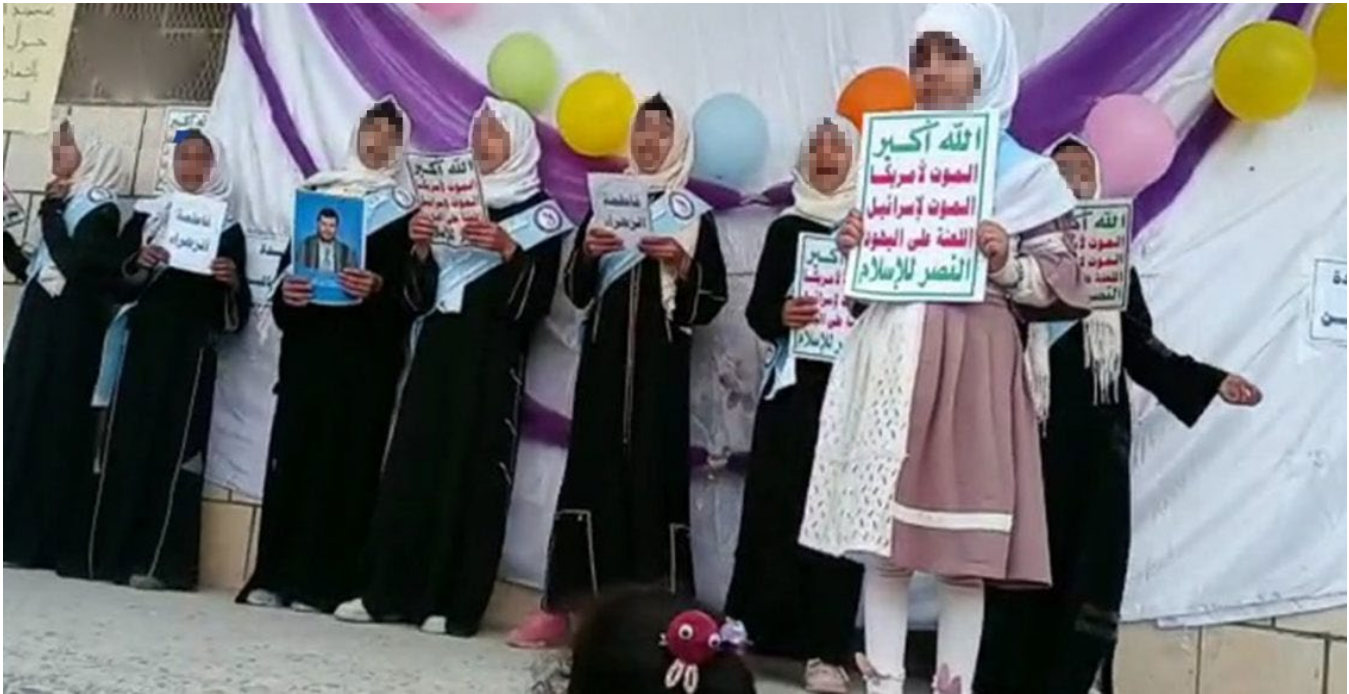
Picture of the January 10, 2023 festival at the Khawla Girls' School with students holding signs with the sarkha written on them. 4