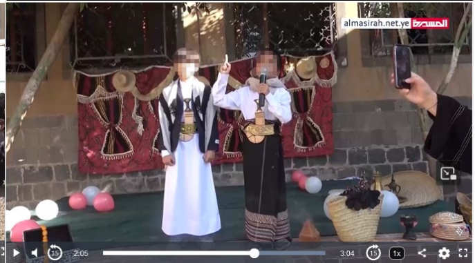
Scenes above from the November 1, 2022 faith identity festival at the Read! School for Science and Technology: children chant the sarkha (left) and deliver a speech (right). 11

Footage from a faith identity festival in October 2022 at the Modern Ishraq Schools provides an example of the sectarian incitement typical of festival speeches, in this case delivered by a boy: