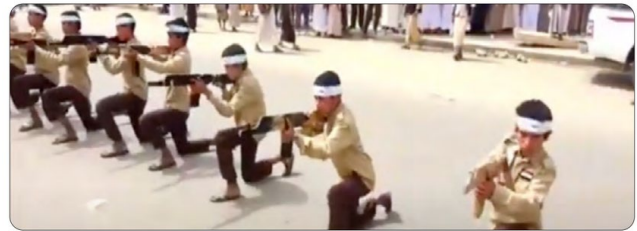
صعدة أختتام أنشطة المراكز الصيفية بعرض كشفي.

Activities at Houthi summer camps in Sana'a (left) and Sa'ada (right).