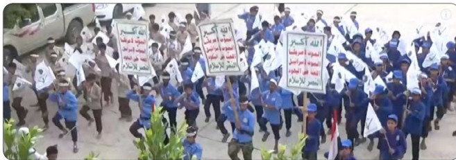
عروض في فعاليات اختتام الأنشطة الصيفية بمحافظة صنعاء.

Two additional features of the Houthi strategy to manipulate education for indoctrination and child recruitment include summer camps and comprehensive curriculum changes at primary and secondary levels. The following graphics, taken from reports by Yemeni fact-checking platform SidqYem, illustrate these summer camps and curriculum changes in action: